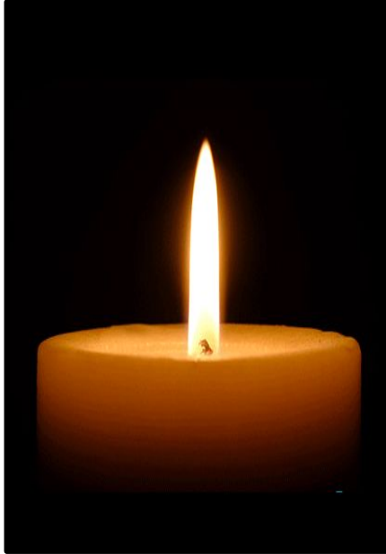
God the Father