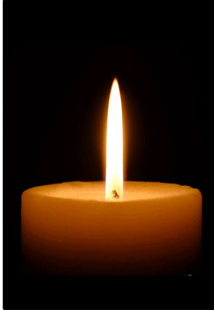
God the Son