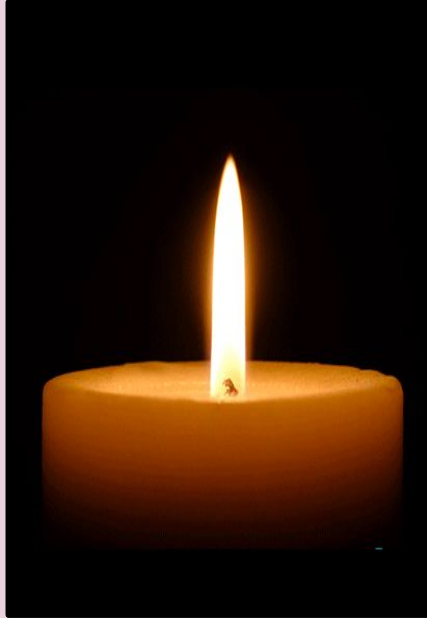
God the Son