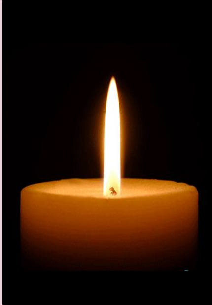
God the Father